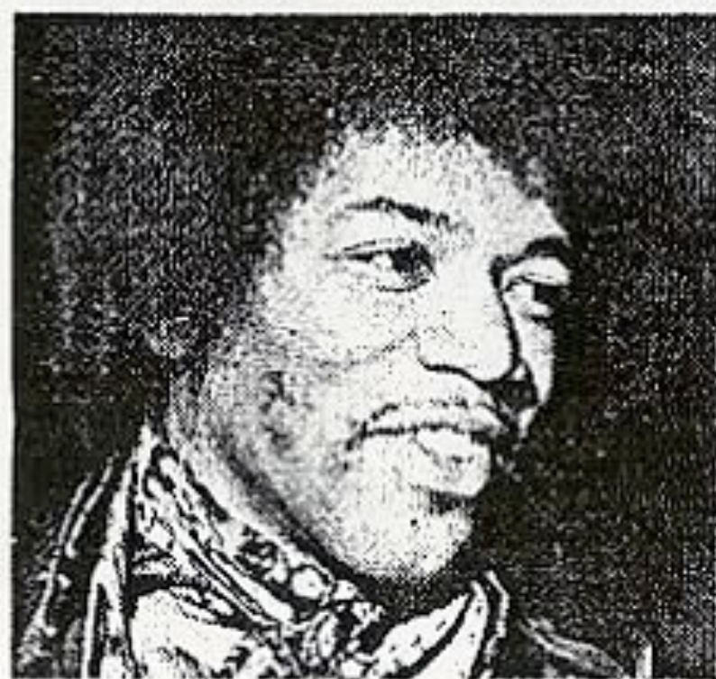
HENDRIX: Monterey hit

T HE Jimi Hendrix Experience are meeting with phenomenal success in America. They have now been fixed to join a nationwide tour with the Monkees tomorrow (Friday).